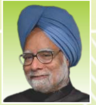
Dr. Manmohan Singh Hon'ble Prime Minister of India